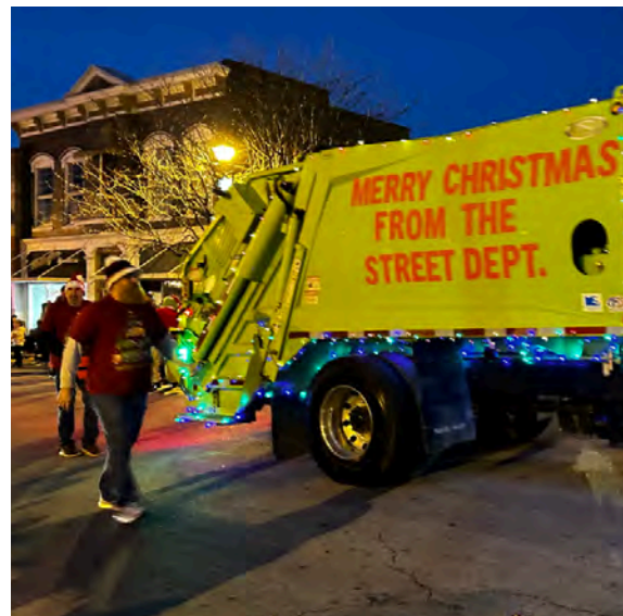
Street Department School Visits & Holiday Walk Parade Float