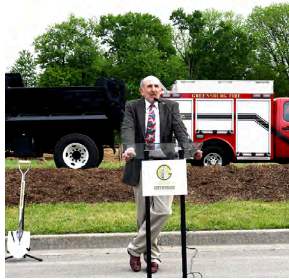
New Street Department Facility Groundbreaking