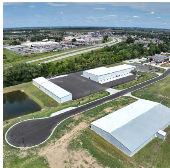
New Street Department Facility Ribbon Cutting & Aerial View