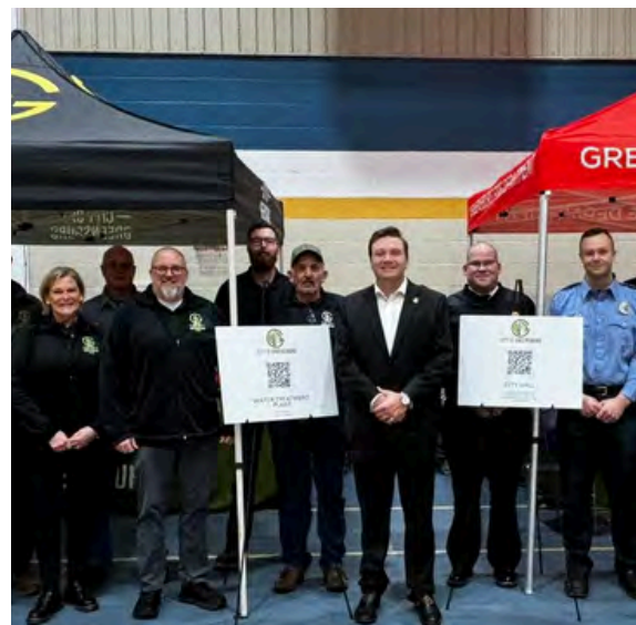
Street Department CPR Training & High School Job Fair